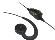
KHS-34 C-Ring In-line PTT Headset (Single Pin Jack)